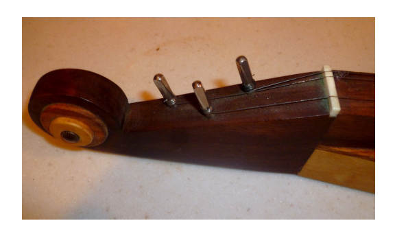
Solid Block Head (shaped like a scroll) with Autoharp Tuning Pins

Scroll Head with wooden pegs...... Guitar Head w/ geared tuners